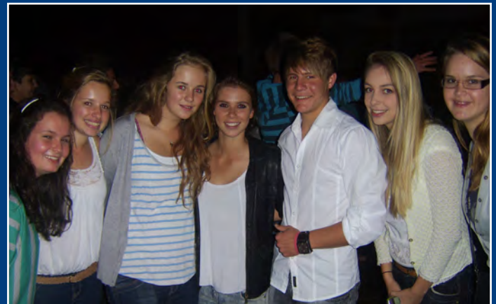
College and DSG pupils enjoying the annual Afrikaans evening