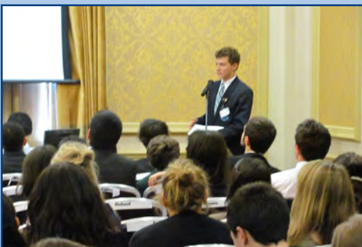
College debaters in action during the 21st Annual SAIMUN Debating Competition in Ireland recently