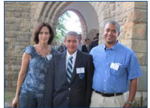
The Starr family - Mullins House