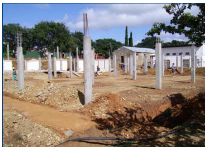
Progress as of 20 January