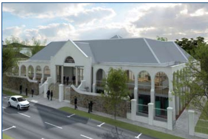
Artists impression of the Front Facade

The new Centralised Kitchen and Dining Hall project is well under way and is proceeding apace. There seems to be some misunderstanding about this project. I want to reiterate that it is not going to be one dining hall, but six dining halls which are separate but which can be opened up to form a bigger unit. The separate dining halls are very much part of the house ethos at College and it is part of our fund raising for the dining hall project that we are going to be looking at this on a house basis.