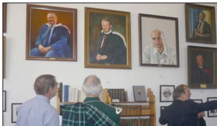
Portraits of past Headmasters are on display in the Andean Resource Centre Resrouce