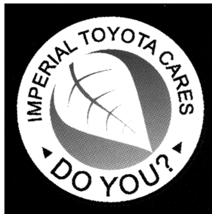
The 'new' Toyota logo