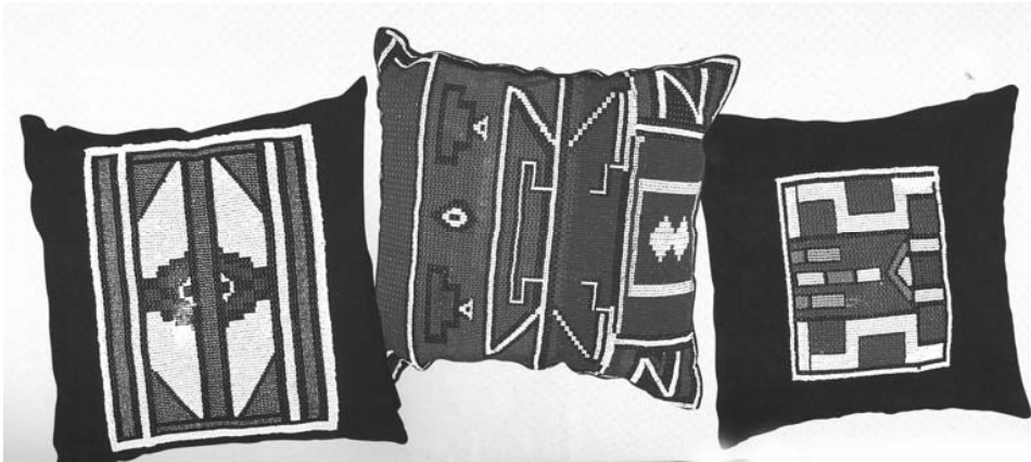
Contemporary Cushion Covers

Traditional design has been altered to service the needs of a contemporary design market.